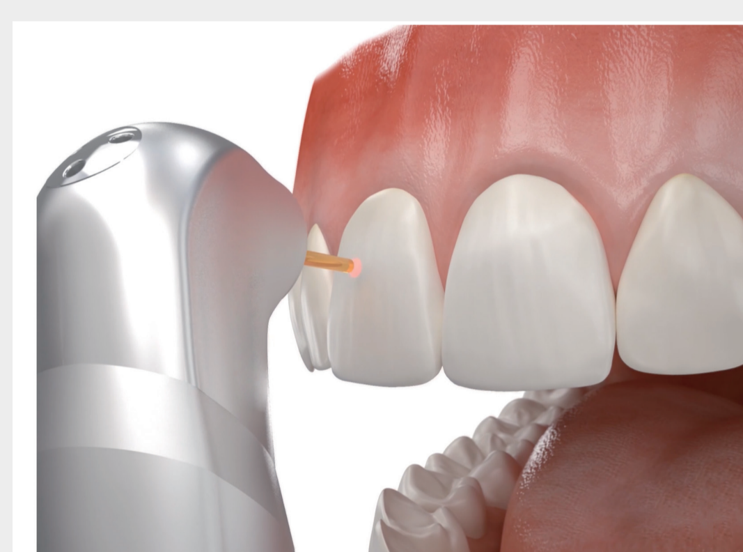
CROWN AND VENEER REMOVAL